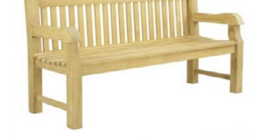
Meridian timber seat