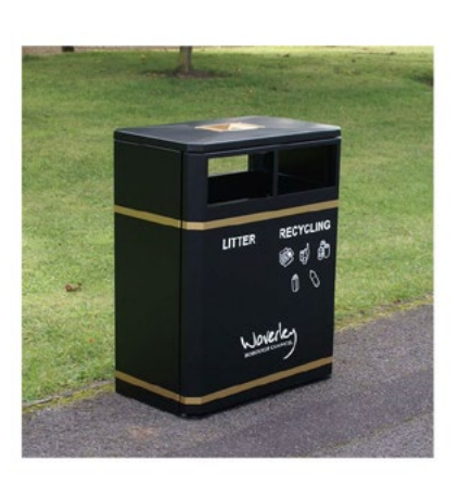
160lt bin & recycling