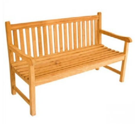
Greenwich timber seat