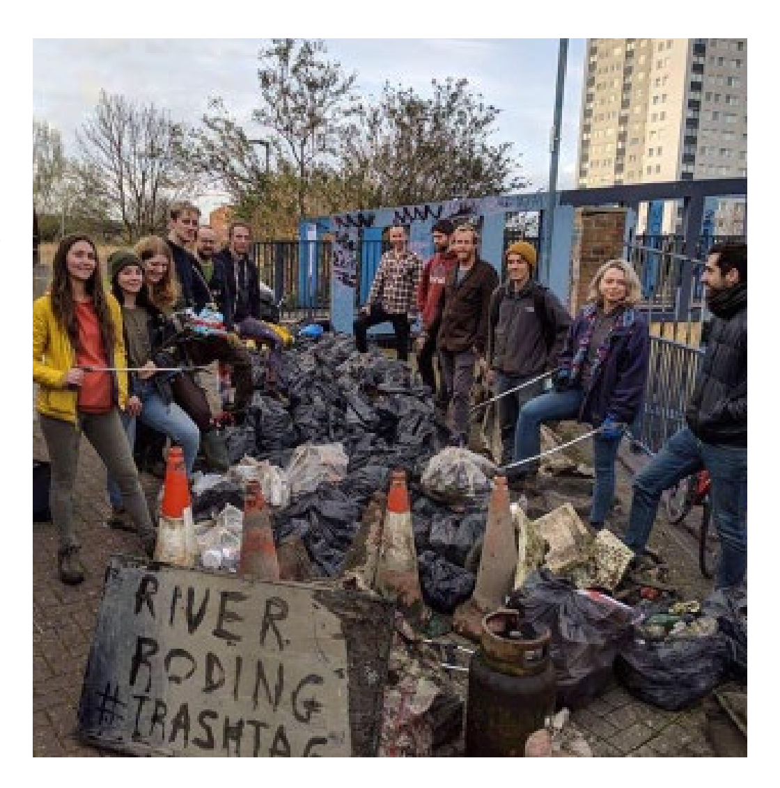
One of our organised litter picking hauls we completed in 2019 that saw volunteers come from all over London and beyond.

In undertaking this task we also will open up a section of river-side path that has been neglected to the extent that it has become impassable. This primary focus will see a section opened up and with lessons learnt from this we hope to expand upon this learning and continue the path further north joining Barking to Ilford reopening an ancient bridle-way and public right of way to create a picturesque walk along a section of the River Roding. With this work complete it will then be possible for local residents and visitors to the area to explore the entire length of the river, whether on foot or on wheels.