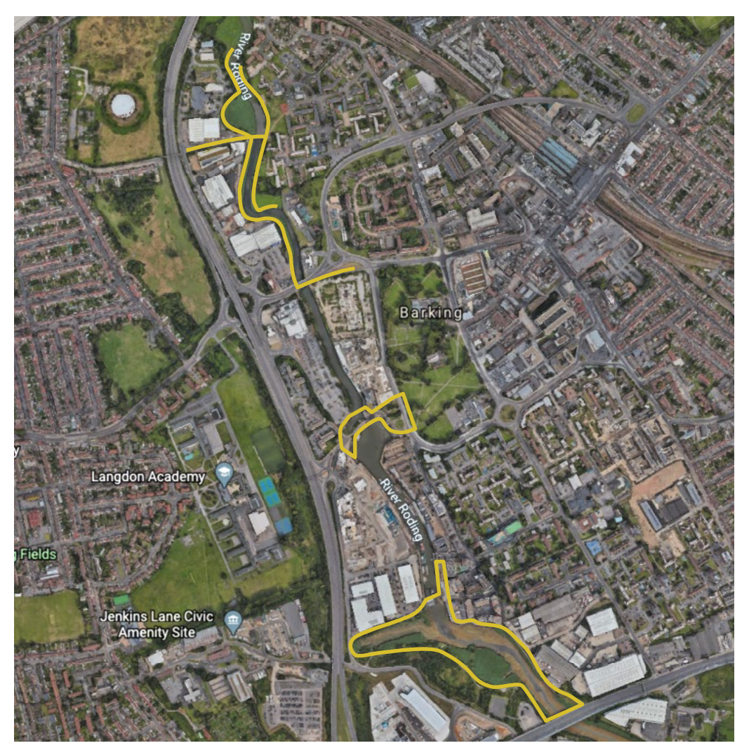
Yellow lines indicate areas the RRT plans to improve

We can confirm that all of the places in which we wish to make improvements are publicly accessible. They are either on the riverside path (which is a public footpath open to all), in public areas (e.g. the area around Town Quay), or (in the case of the poplar trees), in the river, but visible from public areas.