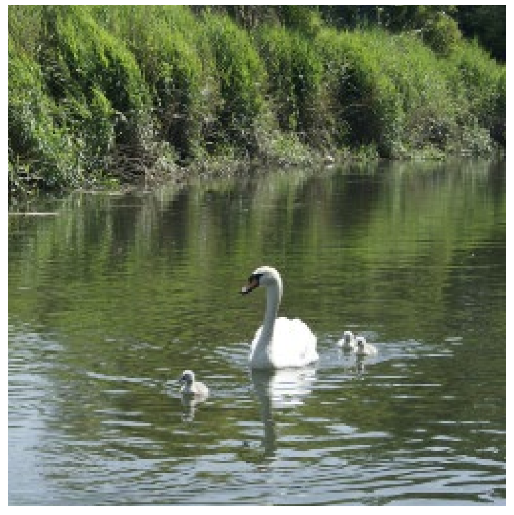
Our local pair of swans with 2019's signets on the River Roding