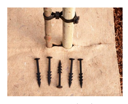
Stakes and protection