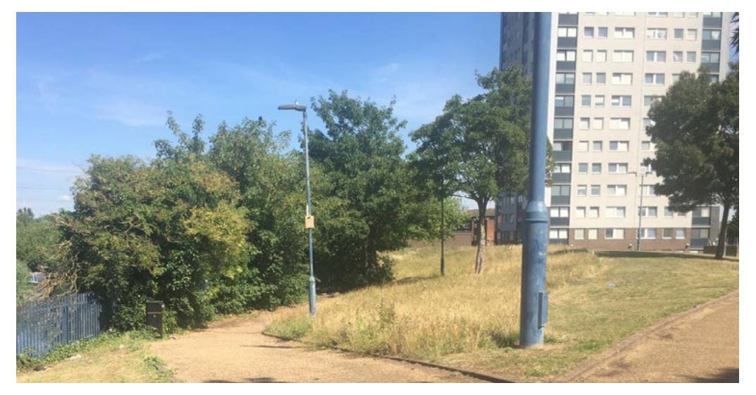
Harts Lane estate

This area of the Harts Lane estate overlooks the river in an especially scenic area with lots of reeds and wildlife. However, at the moment it is difficult for local people to enjoy the view. We would propose installing benches and fruit trees for shading, along with trimming back some of the foliage to give enhanced views of the river.